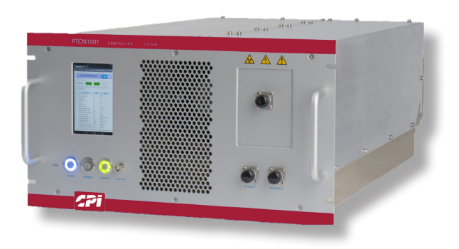
Example PTCM: Can be supplied with or without LCD screen

To learn more about CPI EDB's instrumentation amplifiers capabilities, contact CPI at wecare@cpii-int.com or call +44 (0)20 8573 5555